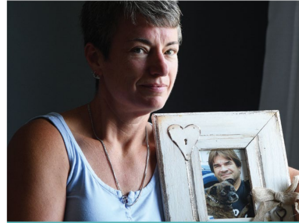
living well with GRIEF

Support for people throughout their illness, improving quality of life and well-being.