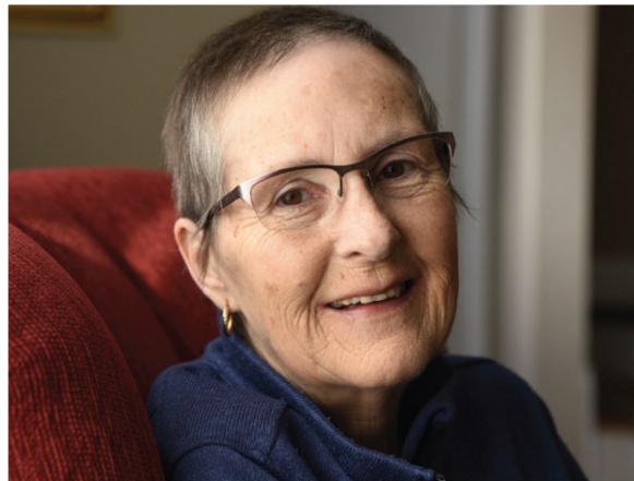
living well at HOME

Care, compassion and dignity for people at end of life and their families.