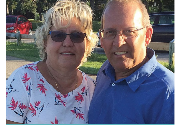
living well as a CAREGIVER

Children, youth and adults explore feelings of grief and loss, in a safe and supportive space.