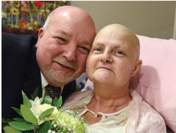
living well at HOSPICE

Care, compassion and dignity for people at end of life and their families.