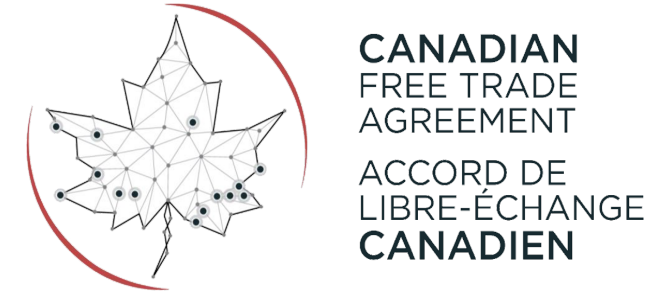
Figure 1. Canadian Free Trade Agreement, (2023)