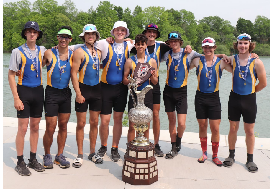
2023 E.L. Crossley Senior Men win back-to-back gold at the Canadian Secondary School Rowing Association championships in St. Catharines, Ontario.