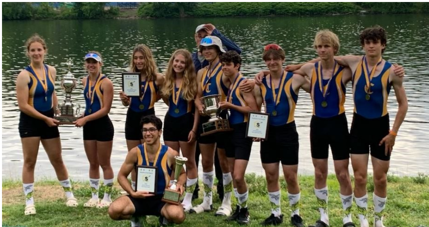
2023 Three E.L. Crossley crews travelled to Philadelphia to compete in the Statesbury Cup regatta, the largest and oldest high school regatta in the world. Going undefeated in the time trials, semi finals and finals, all three Crossley crews won gold .

When you are supporting this team, you are backing a winner, having won 11 consecutive National Championships in a row . Many former Crossley crew have gone on to further rowing success on the Canadian National Team and have been successful at the University level as well. There are also many graduate rowers on NCAA scholarship.