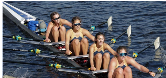
2023 E.L. Crossley Athletes race Head of Charles, Boston MA (with Notre Dame Rowing Club) win gold for Women's Coxed Quad with a 16 second lead!