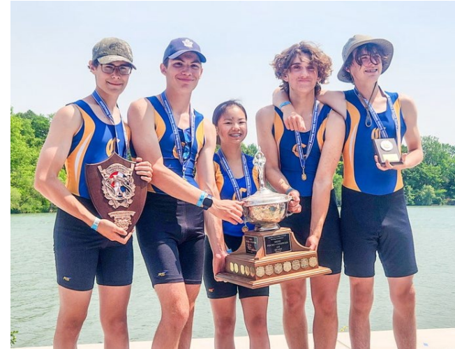
2023 E.L. Crossley Novice Men 72kg Coxed Quad win gold at the Canadian Secondary School Rowing Association Championships in St. Catharines, Ontario.