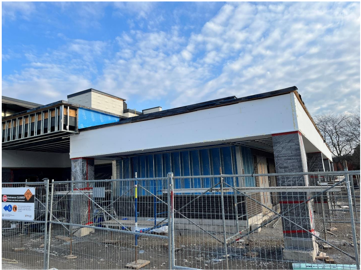
Building exterior with masonry and stucco, awaiting siding