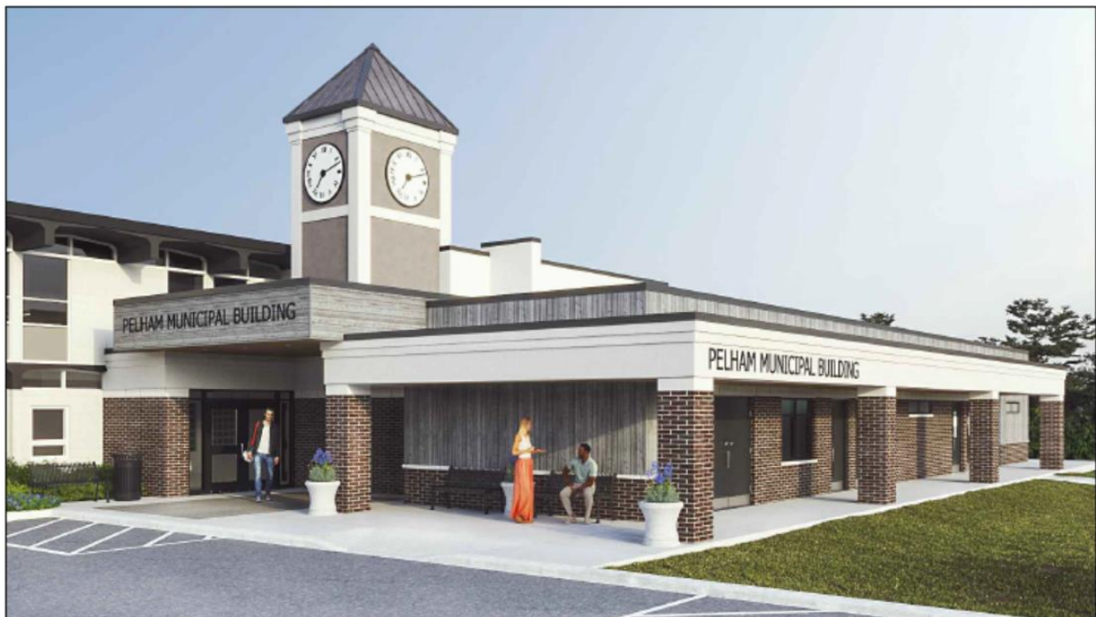
Architect's rendering of the finished product