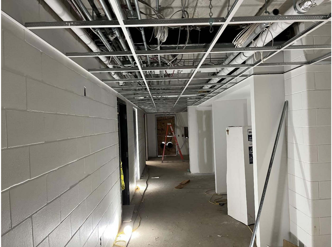
Main corridor of the addition awaiting ceiling tile installation