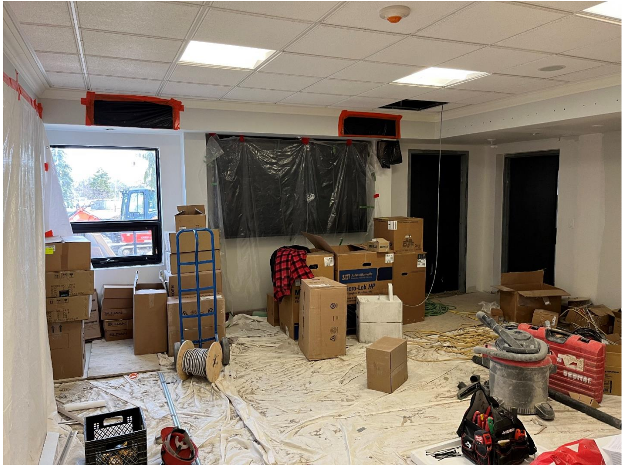
Window and doors installed in Council Chambers