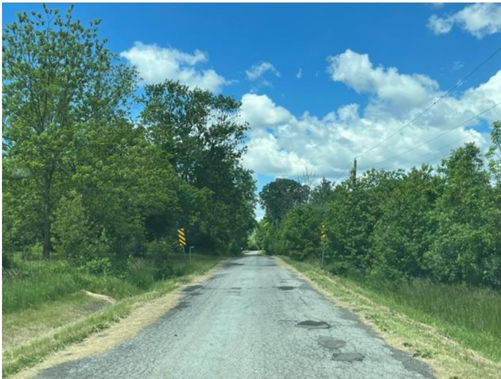
Fig.2-Roland Road between Maple Street and Balfour Street