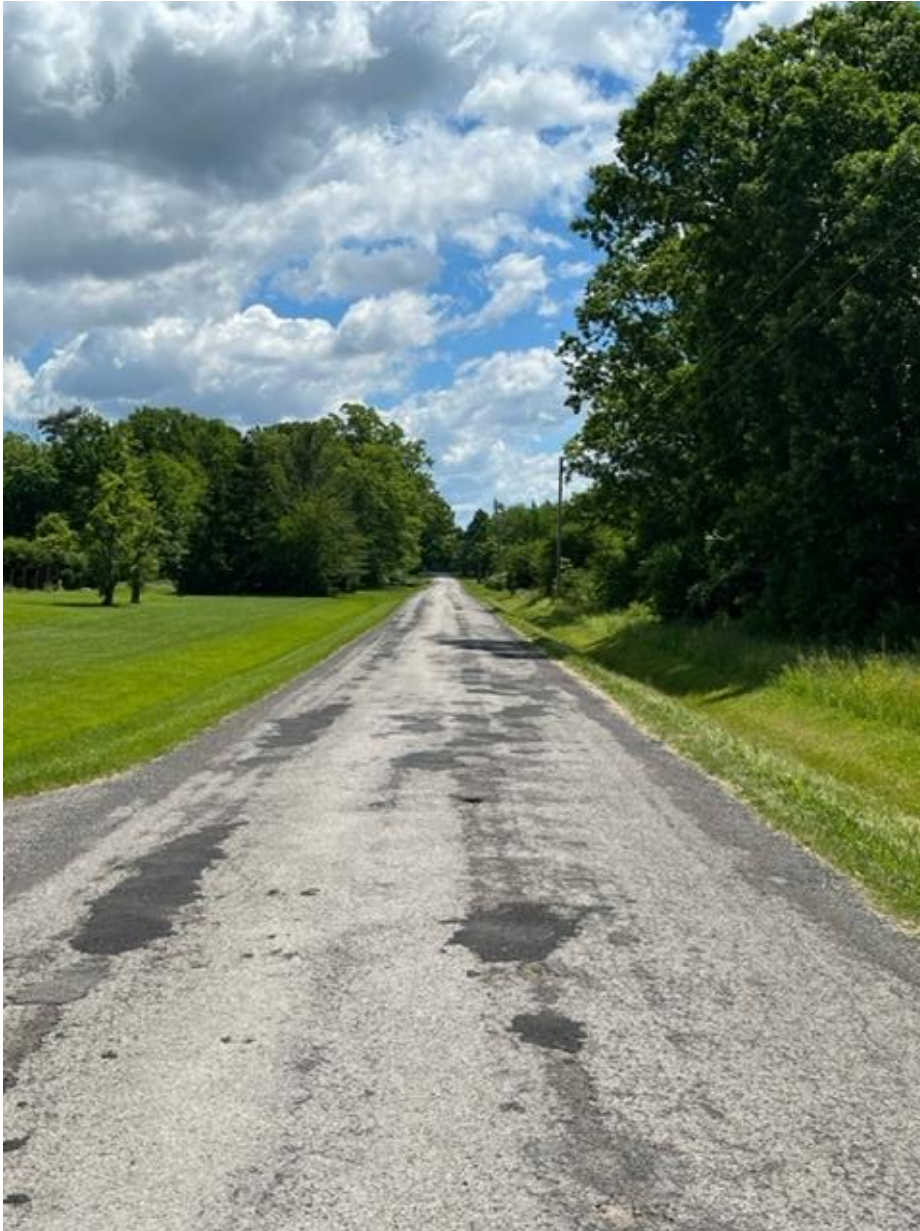
Fig.3-Roland Road between Balfour Street and Cream Street