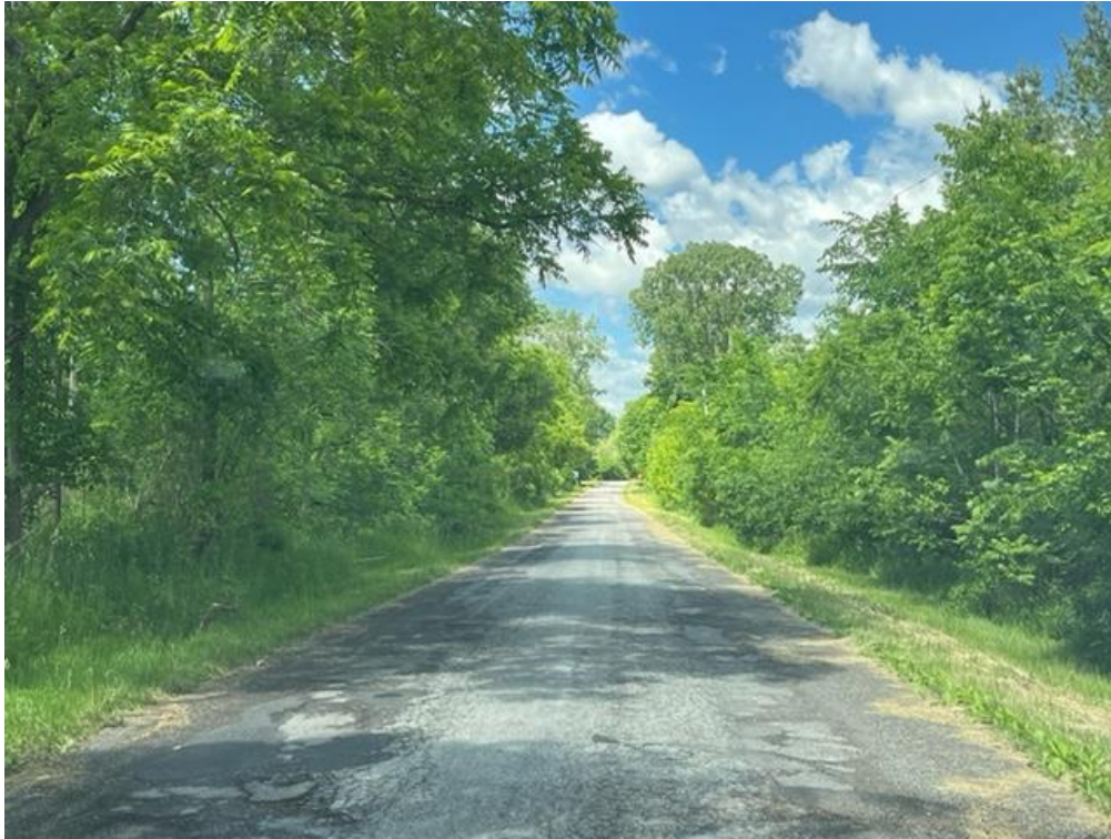
Fig.1-Roland Road between West Limit and Maple Street