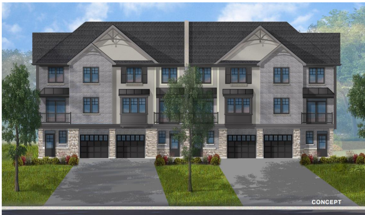
Figure 3: Back-to-Back Townhouse Front Building Elevations

The additional information provided by the developer included a rendering showing conceptual front building elevations for the back-to-back townhouse dwellings (Figure 3).