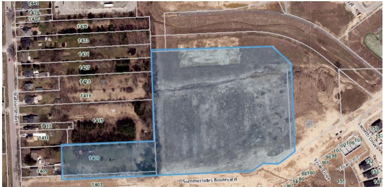
Figure 1: Location of the Property

The draft plan application being considered by Council consists of 16 single detached residential lots (0.7 ha), 14 blocks for 2-storey townhouses (1.257 ha), 4 blocks for rear lane townhouses (0.580 ha), 5 blocks for back-to-back townhouses (0.589 ha) and associated public streets (1.301 ha) and walkway (0.008 ha) (refer to Figure 2).