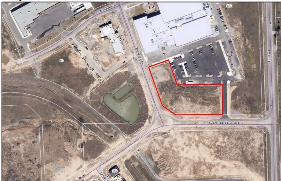
Figure 1: Subject Lands

The purpose of this report is to provide Committee with information regarding an application for site plan control under Section 41 of the Planning Act , R.S.O. 1990, c. P. 13, for the lands described as Part 5 on RP 59R-16105, referred to as Summersides Mews . The subject lands are currently vacant and located on the northeast corner of the roundabout at Summersides Boulevard and Wellspring Way. The lands are surrounded by the Meridian Community Centre to the north, vacant land to the east and south, and a stormwater management pond to the west (Figure 1).