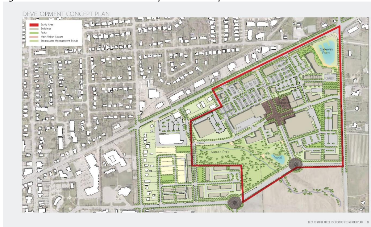
Figure 3 – Site Master Plan Development Concept Plan

The local Official Plan designates the subject land as 'Secondary Plan Area' within the Fonthill Settlement Area. More specifically, the East Fonthill Secondary Plan designates this parcel as EF – Mixed Use within the Commercial/Employment Centre. Policy B1.7.8.3 outlines the permitted uses and intentions of this designation. Permitted uses include apartments, townhouses, secondary suites, live-work units among many other uses.