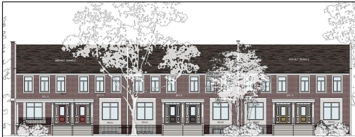
Figure 4: Proposed building Elevation of Block A townhouses fronting Summersides Boulevard

The Summersides Mews development will help buffer the unsightly surface parking lot associated with the Meridian Community Centre (MCC) and it will also enhance the vehicle driveway entrances to the community centre parking lot. Town Planning staff are of the opinion the traditional row houses proposed along Summersides Blvd (Figure 4), the 3-storey apartment building at the roundabout (Figure 5), and the more contemporary townhouses along Wellspring Way positively reinforce the public streetscape and help shield the surface parking lot of the MCC (Figure 6).