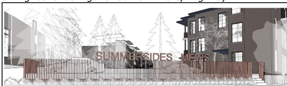
Figure 7: Parking lot rendering viewed from Wellspring Way