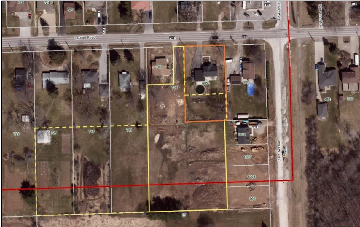
Figure 1: Subject Lands (695 Quaker Road) in orange, consolidated land in yellow