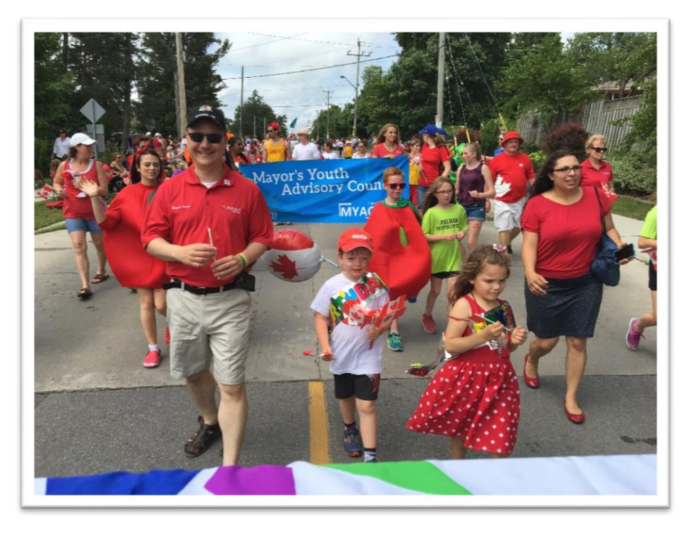
MYAC walking in the Canada Day Parade

Teen Zone was not advertised - 2 More affordable vendors Make Teen Zone closer to Summerfest Over packed Need Dancing on the Street Obstacle course Colour run Carnival Bubble soccer Better music